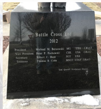
The Battle Cross Monument in the SE Wisconsin Veteran's Memorial cemetery in Union Grove.