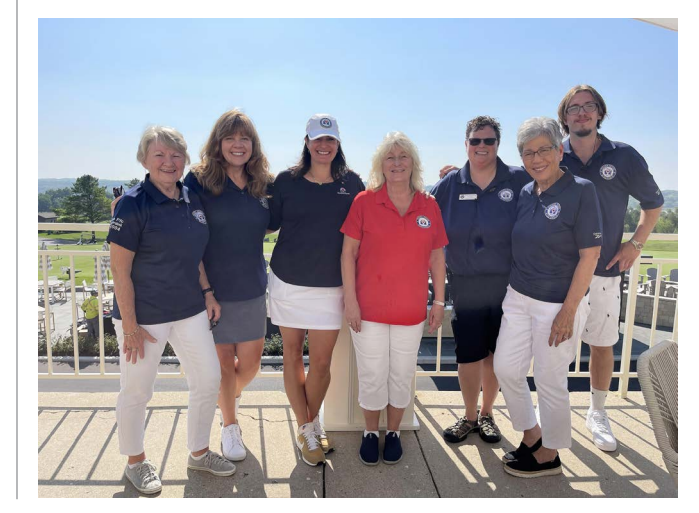
Check out the fun everyone had at the 11th Annual FHW Golf Outing this summer! The weather was perfect. Thank you to everyone that attended and to our volunteers!