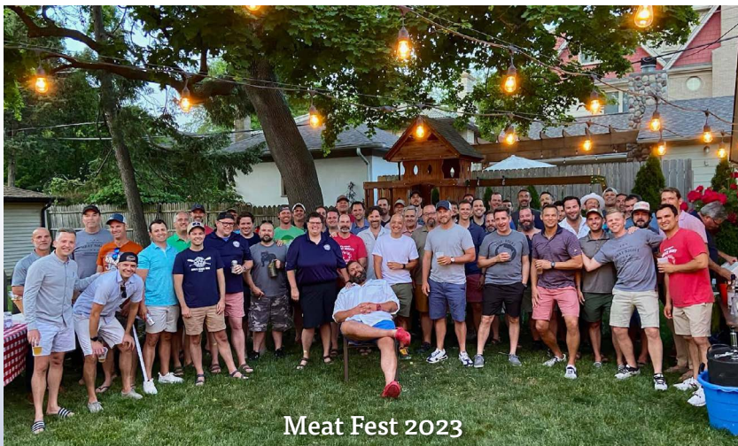
Meat Fest 2023

Check out the fun everyone had at the 11th Annual FHW Golf Outing this summer! The weather was perfect. Thank you to everyone that attended and to our volunteers!